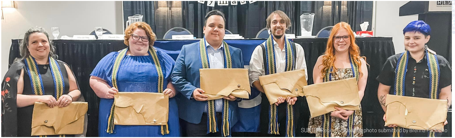
SUNTEP Regina Graduates, photo submitted by Brenna Pacholko