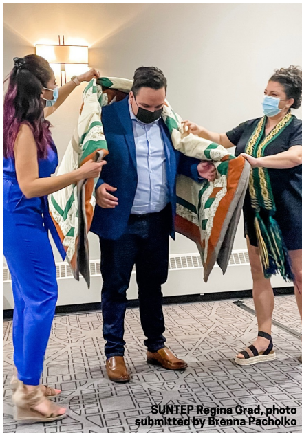
SUNTEP Regina Grad