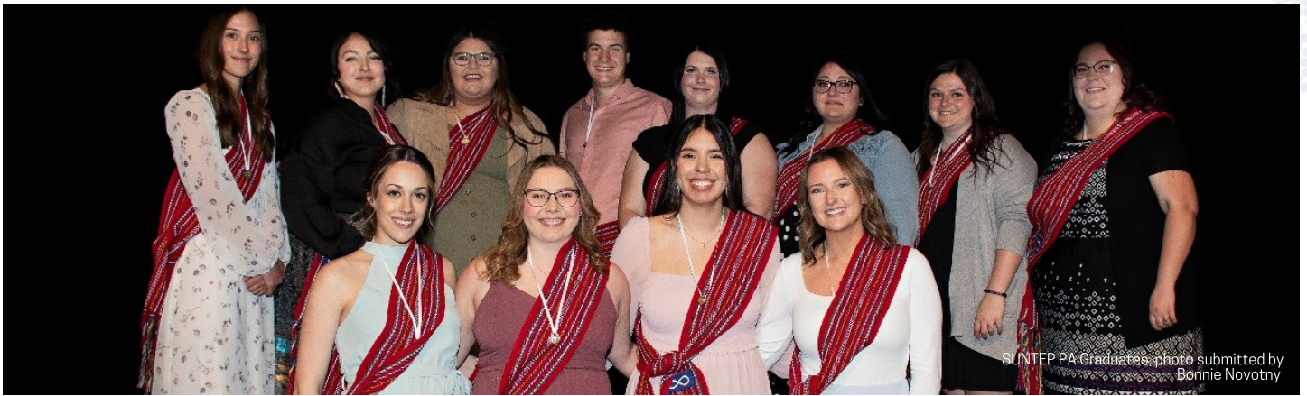
SUNTEP PA Graduates, photo submitted by Bonnie Novotny