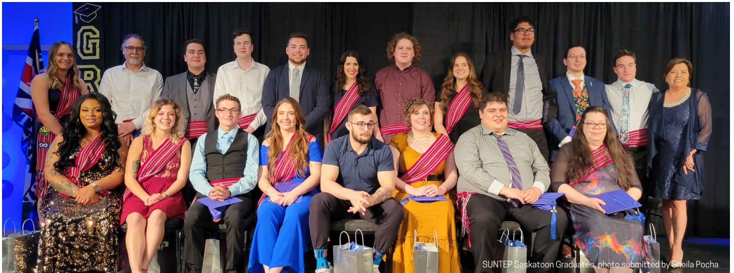
SUNTEP Saskatoon Graduates

The GDI Communicator is an internal newsletter intended to increase communication between management and staff of the Gabriel Dumont Institute of Native Studies and Applied Research